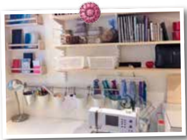
This is Isobel's studio and treasure trove.